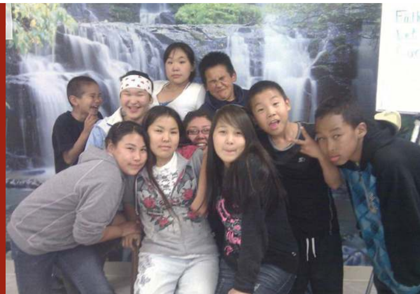
The “Night Owls” in Stebbins, Alaska.