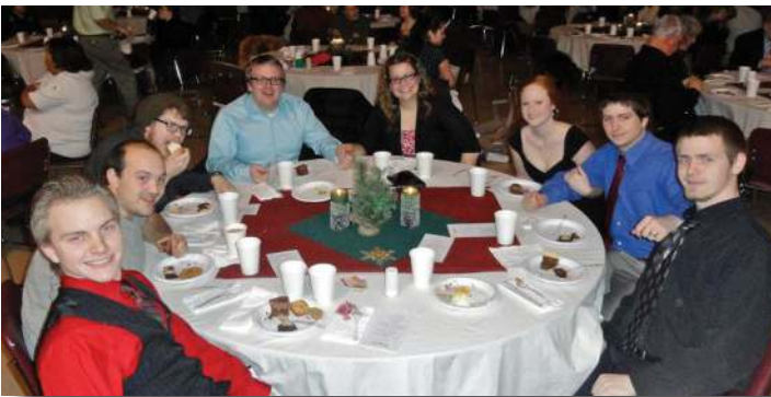
Students and their families enjoy the annual Christmas banquet, hosted on by student government.

“Sons are a heritage from the LORD, children a reward from him.” Psalm 127:3